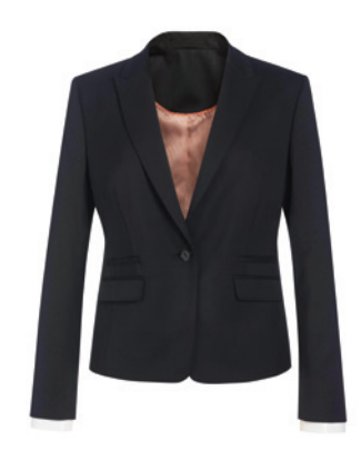
ROSEWOOD JACKET SLIM FIT