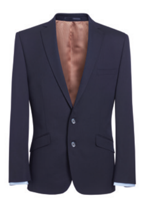
HOLBECK JACKET SLIM FIT A. Navy 2 button jacket, side vents, slim lapels with saddle stitching. 34" - 44" short 34" - 46" regular 34" - 44" long Code & Colours: 3500 A, C, D, G Centre back length at size