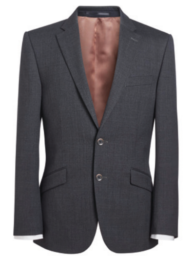
ALDWYCH - Tailored Fit 3125 A, C, D, G