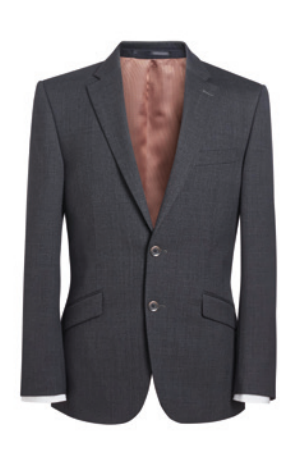
ALDWYCH JACKET TAILORED FIT G. Mid Grey 2 button, side vents. 36" - 48" short 36" - 56" regular 38" - 48" long Code & Colours: 3125 A, C, D, G Centre back length at size