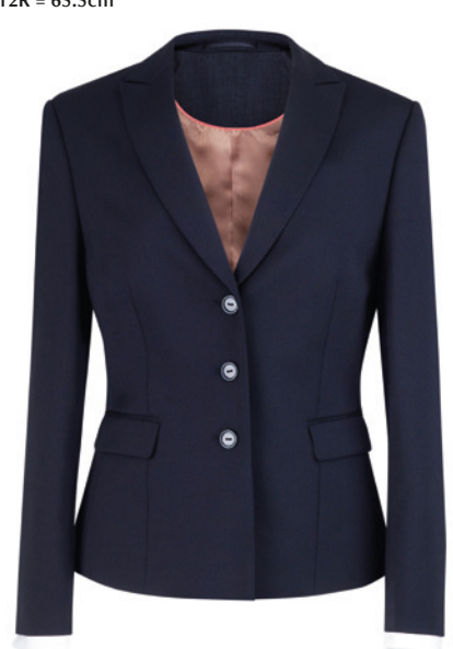
RITZ - Tailored Fit 2227 A, C, D, G