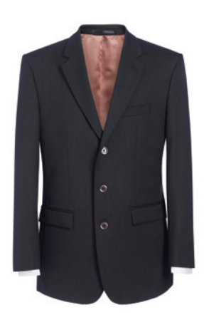
LANGHAM JACKET CLASSIC FIT C. Charcoal 3 button, centre vent. 36" - 48" short 36" - 60" regular 38" - 48" long Code & Colours: 5984 A, C, D Centre back length at size