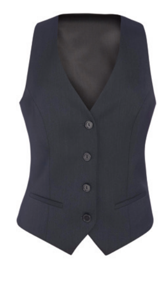
WALDORF - Tailored Fit