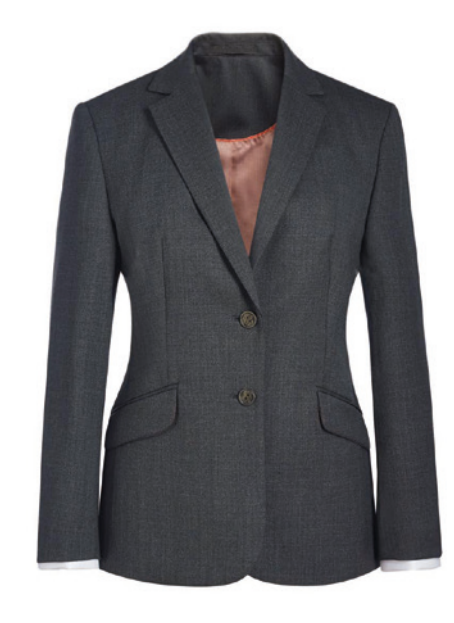
CONNAUGHT - Classic Fit 2226 A, C, D, G