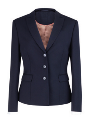
RITZ JACKET TAILORED FIT A. Navy