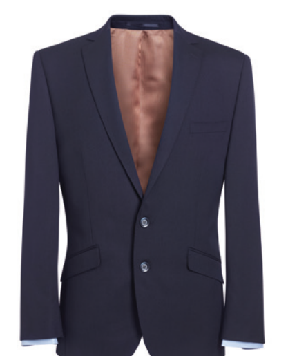
HOLBECK - Slim Fit 3500 A, C, D, G