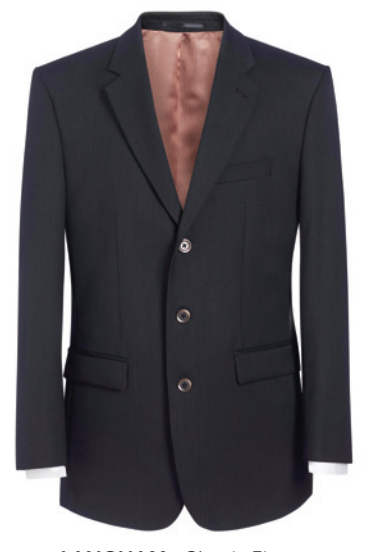
LANGHAM - Classic Fit 5984 A, C, D