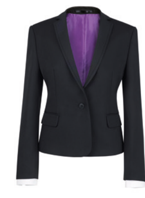
SATURN JACKET TAILORED FIT