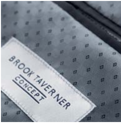
Concept collection interior